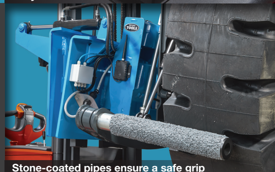
Stone-coated pipes ensure a safe grip