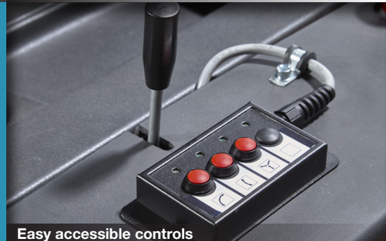
Easy accessible controls