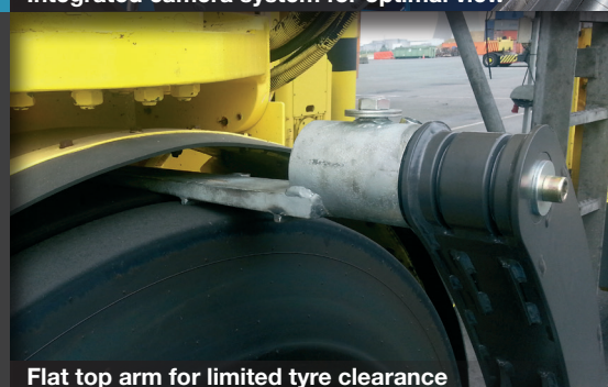
Flat top arm for limited tyre clearance