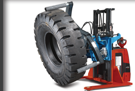
Precise \pm 15^\circ tilt